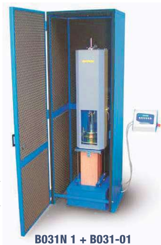
B031N 1 + B031-01