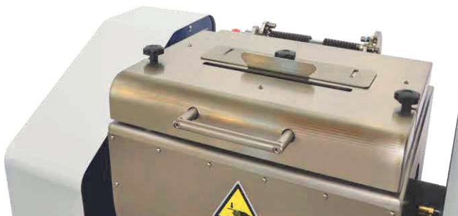
Detail: slot on the top of the lid