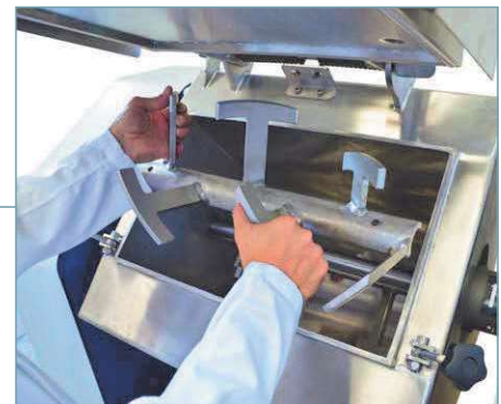
Detail of the detachable mixing shaft with helical blades