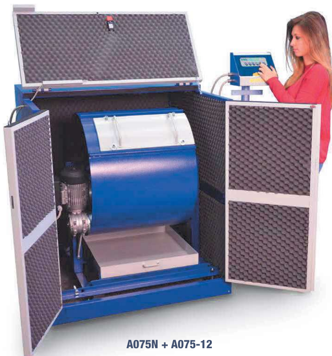
A075N + A075-12

A076-02 SET OF 12 ABRASIVE CHARGES, conforming to EN | NF Standards.