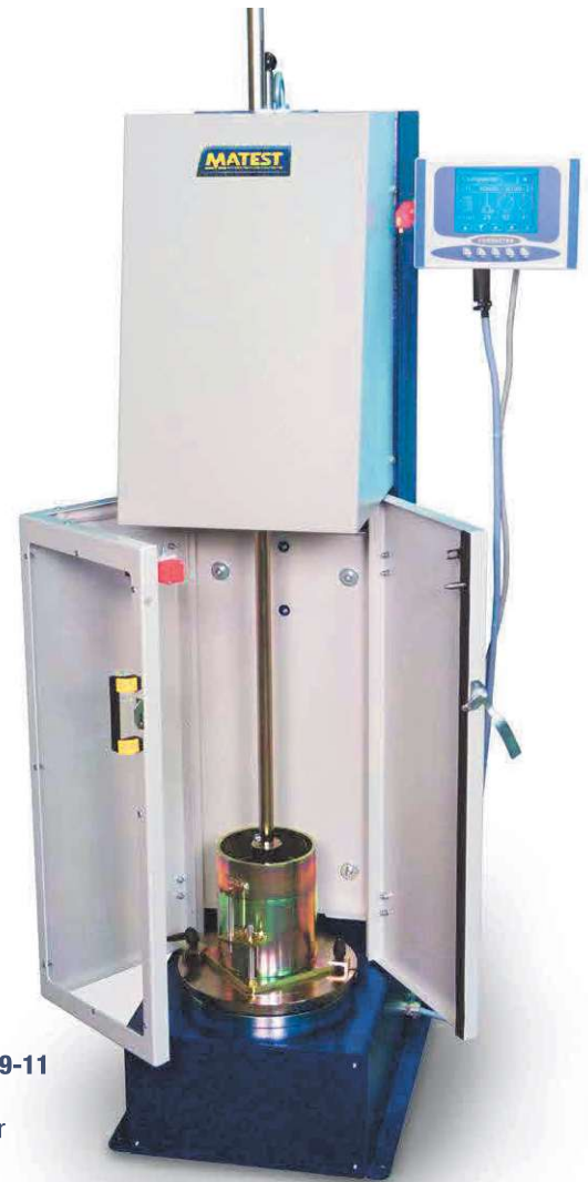
S199+S199-11 with mould and rammer