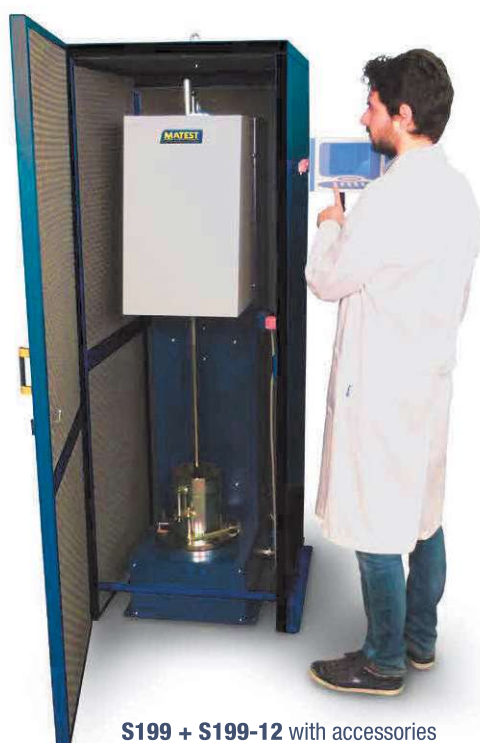
S199 + S199-12 with accessories

S198-23 Kit of two devices fixing the mould to the table.