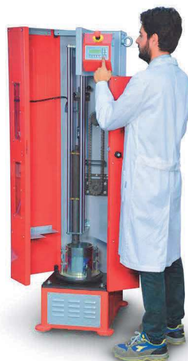
S199TS + S199T-03

S199T-04 RAMMER Ø 50.8 mm with interchangeable weight from 2495 ± 3g to 4539 ± 5g. STANDARDS: ASTM D698, D1557, D1883 | CNR N. 69, CNR UNI 10009 | AASHTO T99, T180, T193