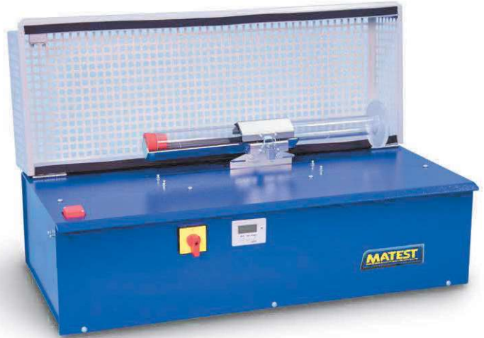
S160-01N + S158-03N + S158-02

Same as S160N, but equipped with steel Security Cabinet, conforming to CE Safety Directive. When opening cabinet's door during shaker working, a microswitch automatically stops the machine.