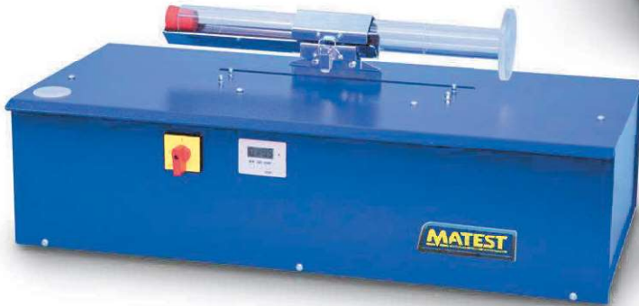
S160N + S158-03N + S158-02