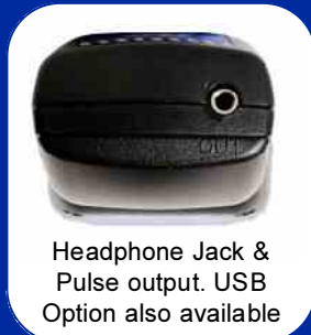
Headphone Jack & Pulse output. USB Option also available