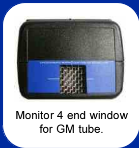
Monitor 4 end window for GM tube.