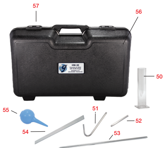
Air Meter Set Replacement Component Identification