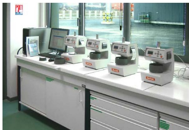
4 AUTOVICAT linked to PC via WinLect32 - VICATEST software